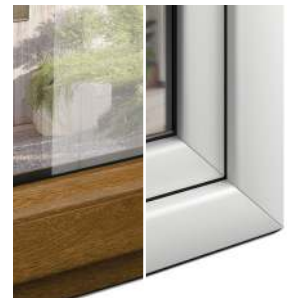
Colour Inside: Golden Oak Colour Outside: White