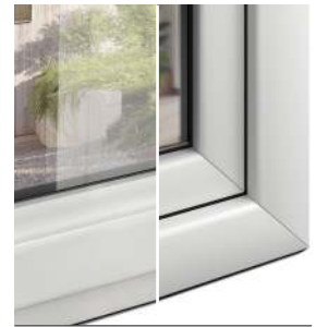
Colour Inside: Premium White Colour Outside: White