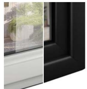
Colour Inside: White Colour Outside: Ash Black