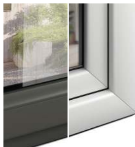
Colour Inside: Aluminium Grey Colour Outside: White