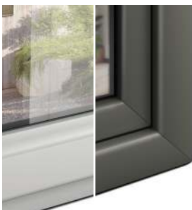
Colour Inside: White Colour Outside: Aluminium Grey