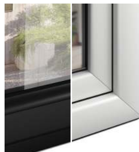
Colour Inside: Ash Black Colour Outside: White