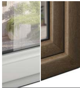
Colour Inside: White Colour Outside: Nut Tree