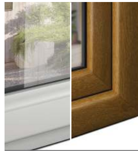
Colour Inside: White Colour Outside: Golden Oak