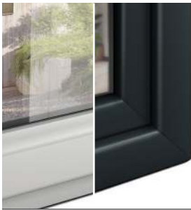
Colour Inside: White Colour Outside: Anthracite Grey

customisation by allowing them to create a different look for the inside and outside of their home.