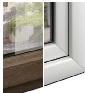
Colour Inside: Nut Tree Colour Outside: White