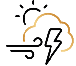
PROTECT AGAINST EXTREME WEATHER