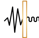
REDUCE EXTERNAL ENVIRONMENTAL NOISE